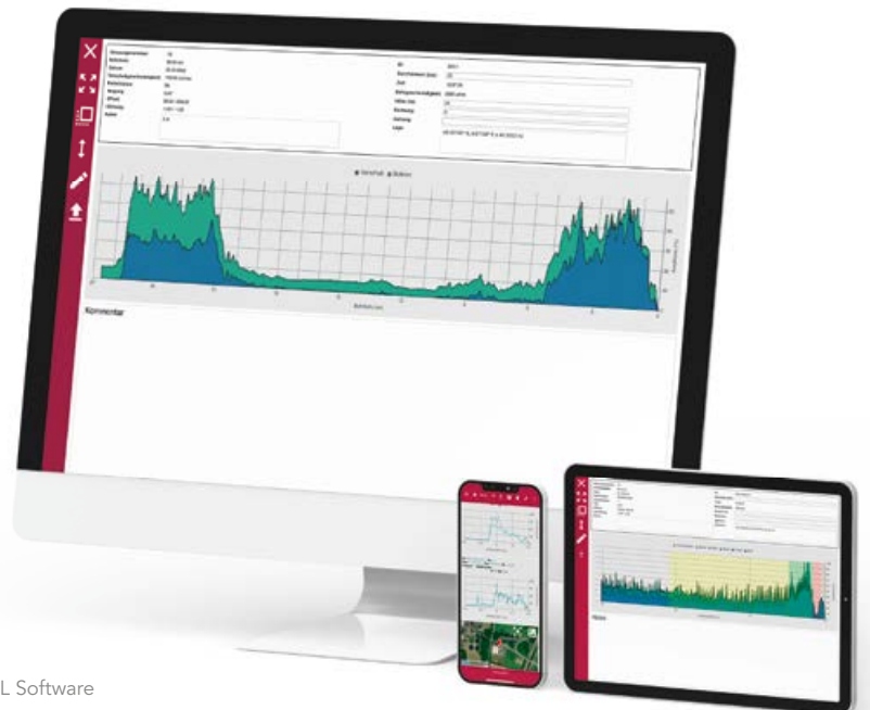
Measurement graphs shown in the IML Software

In addition to the visual inspection, the IML-RESI PowerDrill® provides non-subjective results. Our office offers training and customer support preparing the operator for safe, effective, and proper handling of the equipment. With an international presence, large network operators such as German Telekom, have been relying on the IML-RESI PowerDrill® for many years.